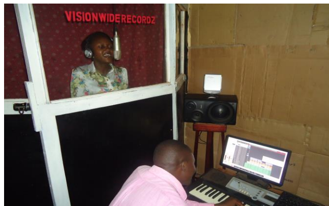
One of the Staffs under this project tests song recording services in a studio that was started by one of the returnees to Uganda from UK. This project starts various projects for returnees to help them settle and earn a living in their countries of destination

InterAid Uganda in partnership with Refugee Action UK implements the Assisted Voluntary Returns Programme (AVR) to support Ugandans living in the UK who have opted to return to Uganda with their Reintegration process.