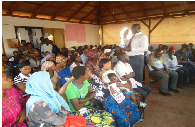
The Assistant Legal Officer addressing refugees during one of the morning addresses at the Program Office