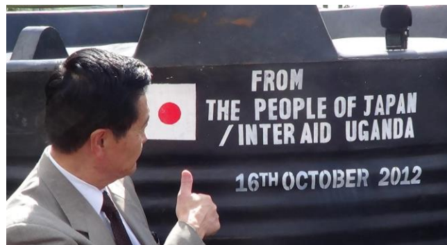
The Japanese Ambassador to Uganda thumbs up after commissioning the water project in Kisoro