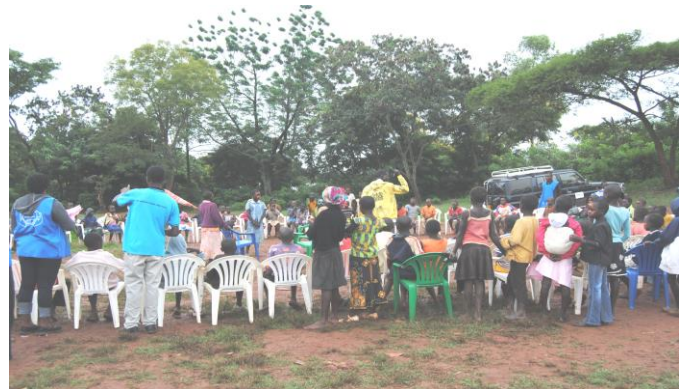
Refugee children participating in one of the open days in Kiryandongo Refugee Settlement. InterAid conducts 3 open days each year for its children beneficiaries to prepare them for the upcoming term.