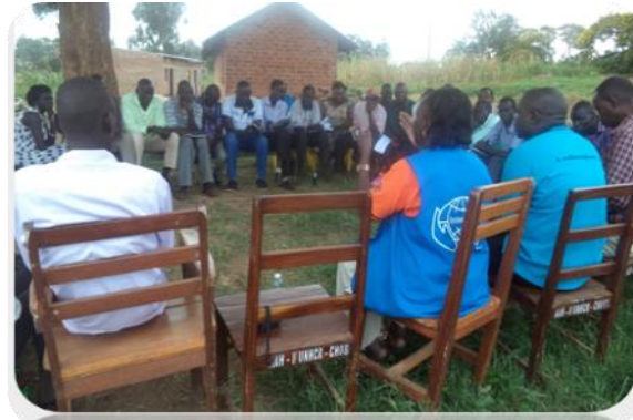
Community Outreach meeting in Kiryandongo Refugee Settlement